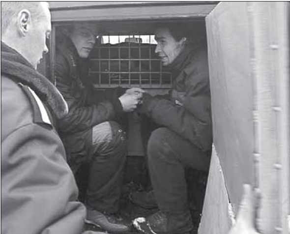
Detentions of young people during the St. Valentine's Day, Minsk