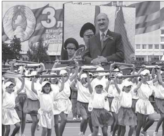
Celebration of the official Independence Day, Minsk, July 3 rd