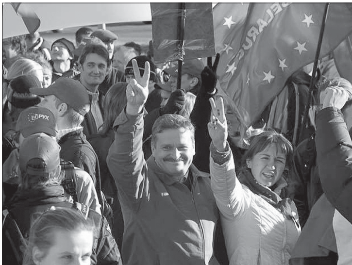
European March, October 14 th , Minsk