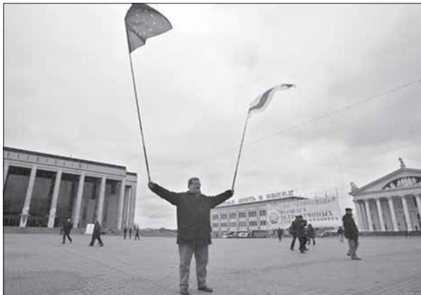
National and EU flags on Kastyrychitskaya Square, November 4 th , Minsk