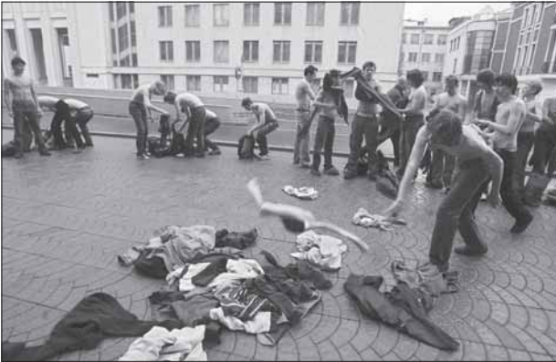
Student action against benefit cuts near the Ministry of Education, Minsk, May 10 th