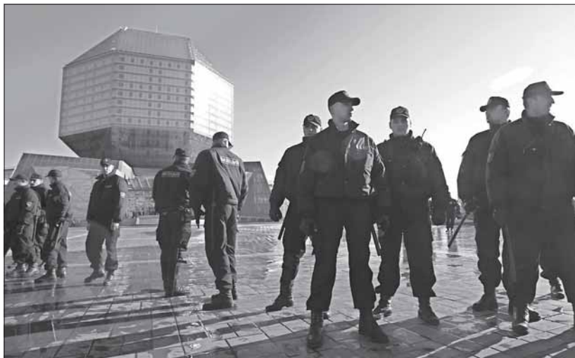
Leaving the territory near the National Library after celebration of the Freedom Day, March 25 th