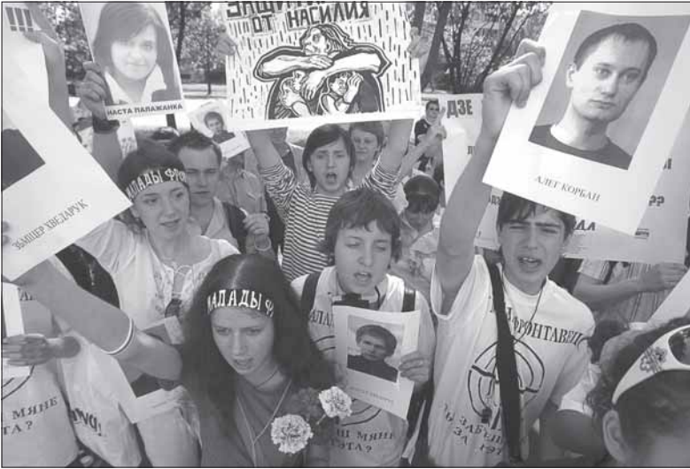
Activists of "Young Front" protest against prosecution of their colleagues, Minsk