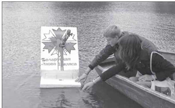
BPF Youth action against discrimination of the Belarusian language, Minsk, September 1 st