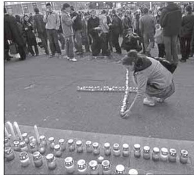
Action in defense of St. Joseph Church and Bernardine monastery, Minsk, April 16 th