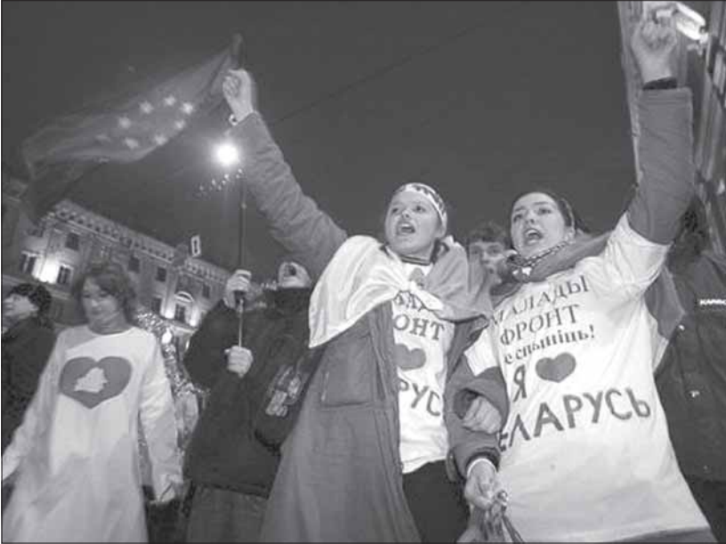
Young Front action on St. Valentine's Day, Minsk