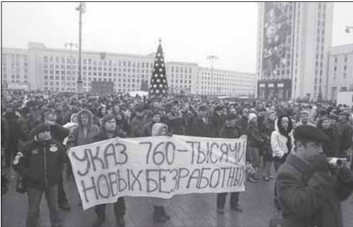
December 10 th . Minsk. Entrepreneurs are protesting