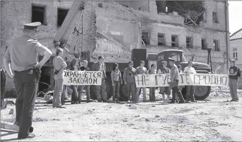
Hrodna activists protest against ruining of historical buildings in the old part of Hrodna. Hrodna, May 24 th