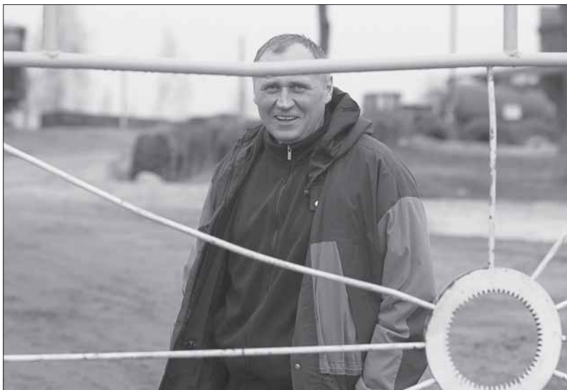
Politician Mikola Statkevich serves his sentence, Blon village, Minsk region