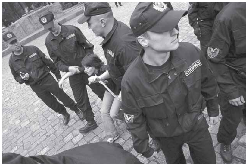
Detention of participant of celebration of the Independence Day, July 27 th , Minsk