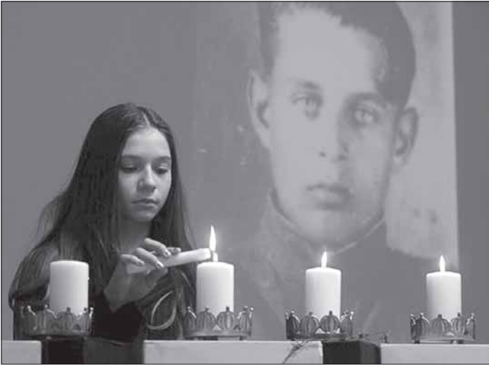
January 27th, Holocaust Victims Memorial Day, Jewish community house