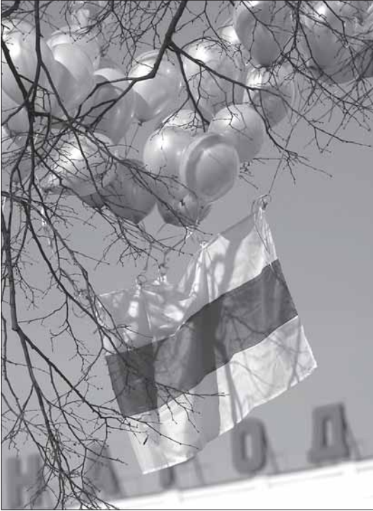
National white-red-white flag over streams over Victory Square in Minsk, March 10 th