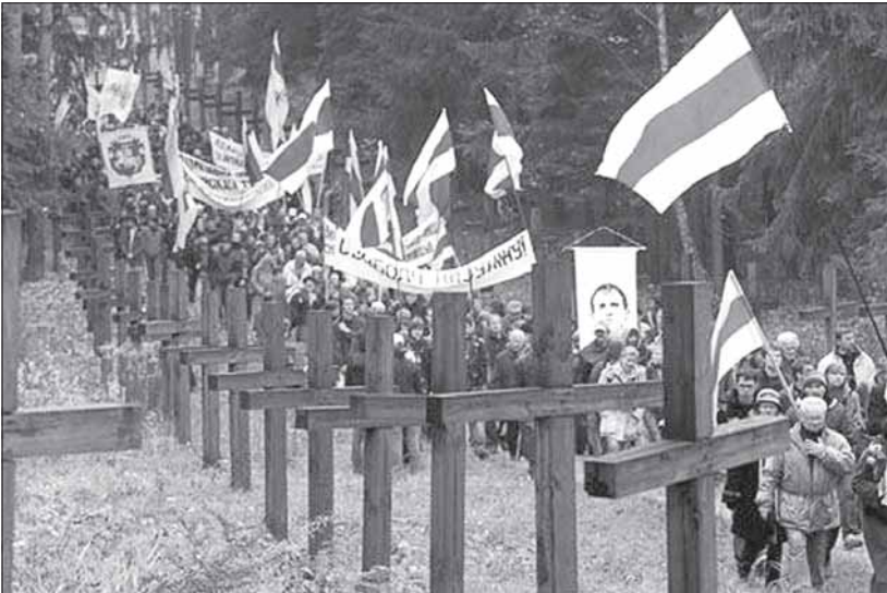
March to Kurapaty, place of mass burial of victims of Stalinist repression, on the Ancestors' Day (Dziady), October 28 th , Minsk