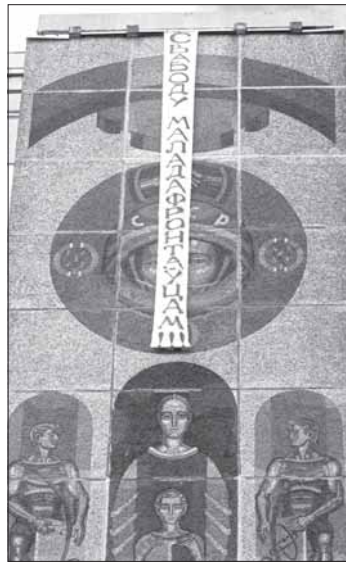
Banner in Minsk "Freedom to Young Front Activist!!!"